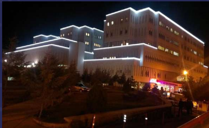
Tabriz Imam Reza Hospital

It is a pleasure for all of us to extend our gratitude and welcome to all participants coming from all over the world to make this opportunity possible. We hope this meeting will be very informative in advancing our views on the nature and different aspects and also the means of dealing with pulmonary vascular diseases and will help in further facilitate the communication of the scientist interested in this field.